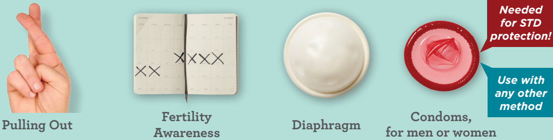
Pulling Out Fertility Awareness Diaphragm Condoms, for men or women