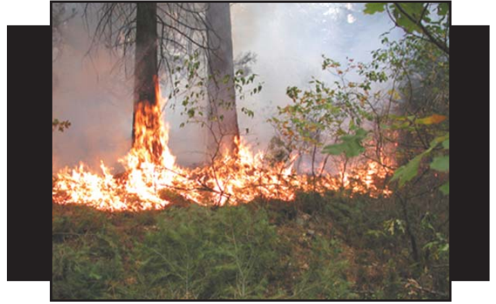
A VMP burn removes the dense underbrush without killing the trees.

The CDF Vegetation Management Program (VMP) is a cost-sharing program with landowners. The program focuses on the use of prescribed fire, and mechanical means, for addressing wildland fire fuel hazards and other resource management issues on State Responsibility Area (SRA) lands.