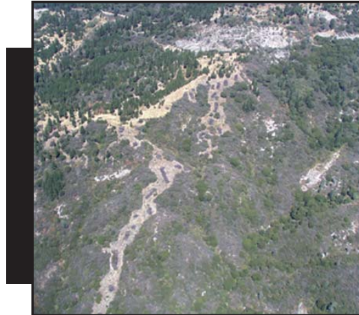
The varying pattern, and vegetation left throughout this fuel break, serves to blend better with the environment and maintains wildlife habitat.

Fuel breaks are wide strips of land on which trees and vegetation have been significantly, and in some cases permanently, reduced or removed. They may also be large greenbelt areas built into communities. These areas can slow, and even stop, the spread of a wildland fire because they provide fewer fuels to carry the flames. They also provide firefighters with safe zones to take a stand against a wildfire, or retreat from flames if the need arises.