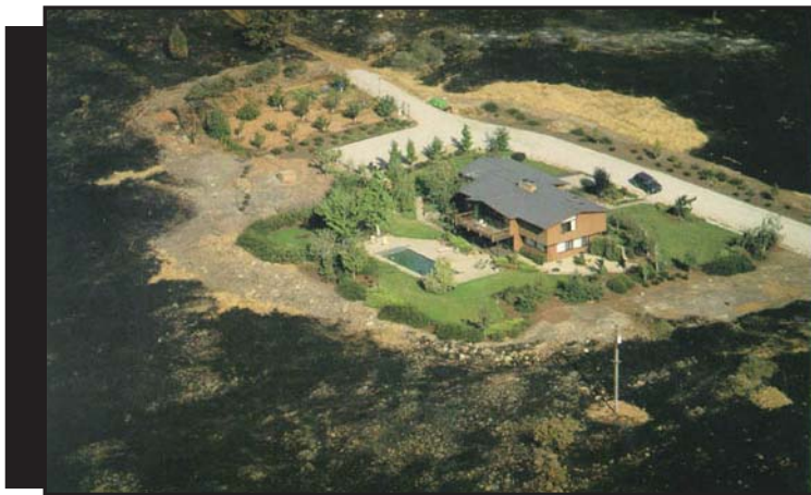
While the fire burned all around, defensible space, gave firefighters the chance to save this home.

In 2003, over 3,700 homes were destroyed by wildfires in Southern California alone. Pre-Fire Management is a term all Californian's living in a wildland setting need to know.