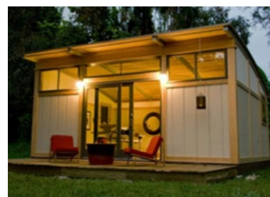
HCD Approved on Engineered Foundation