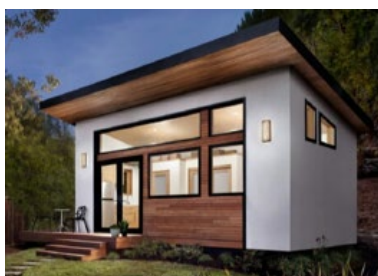
Site Built per CRC