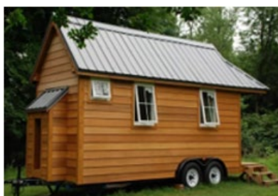
DMV Approved (RV)

Recreational Vehicles (RVs) are constructed to national standards including ANSI 119.2 or 119.5 and NFPA 1192 standards. They must be registered and licensed through the California Department of Motor Vehicles (DMV). RVs and other housing on wheels, compliant with the above regulations, are allowed within RV parks or campgrounds, or only as temporary housing per Urgency Ordinances contained under Chapter 53 and 54 of the Butte County Code. These are not allowed as permanent dwelling units within private property.