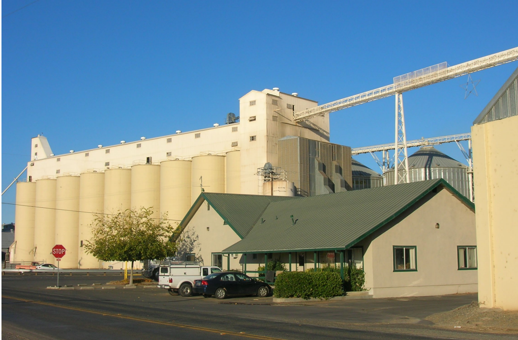
Agricultural products and processing have long been central to Butte County's economy.

Butte County, along with its rural character, has a strong economy based in its agricultural, commercial, industrial, educational and professional industries. The County encourages economic development within these industries, and the development and enrichment of new industries that are job-creating and environmentally sustainable.