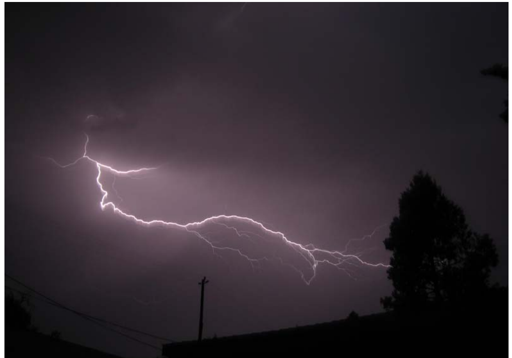
Lightening Storm, August, 2008, Butte County