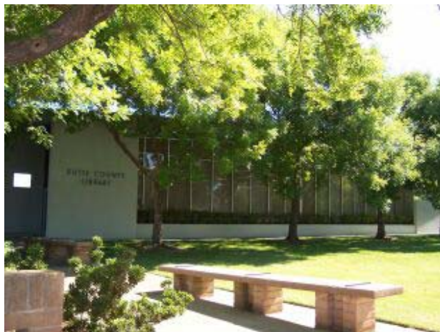
Butte County Library Oroville, CA

For more information about any of the Butte County Library programs and services, please call 530-538-7525 or visit the Library's website.