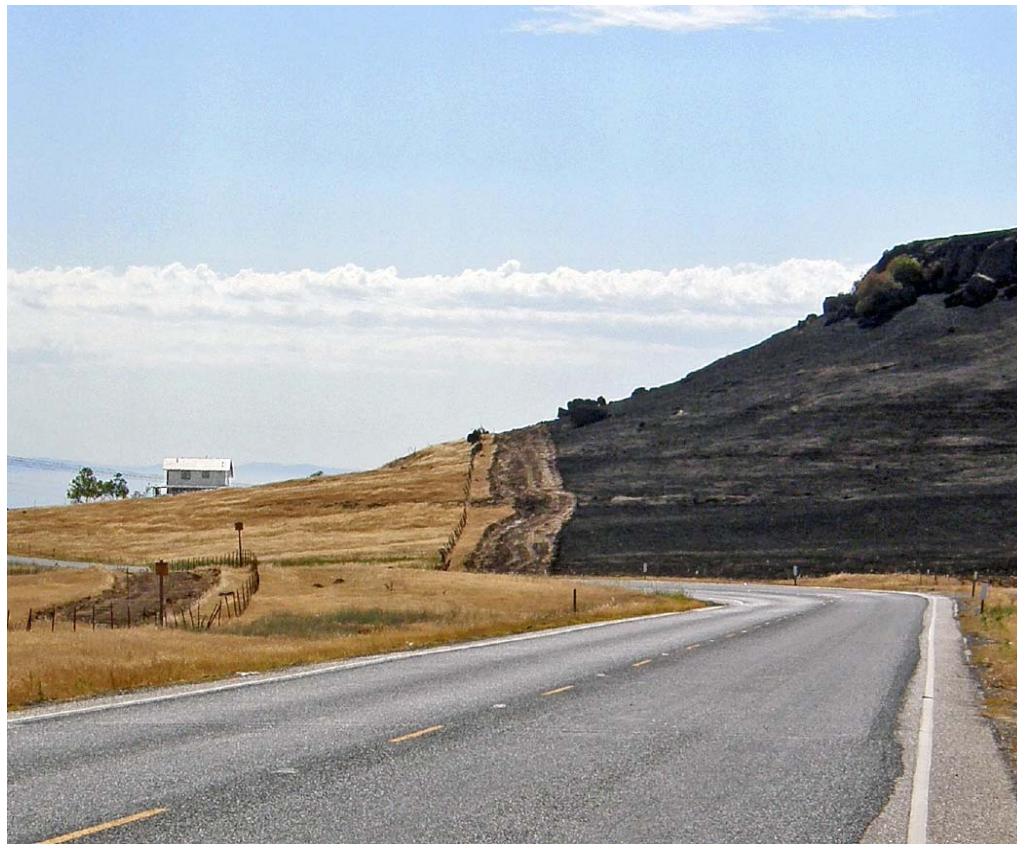
Fire break stopped fire from progressing, Butte County, 2008