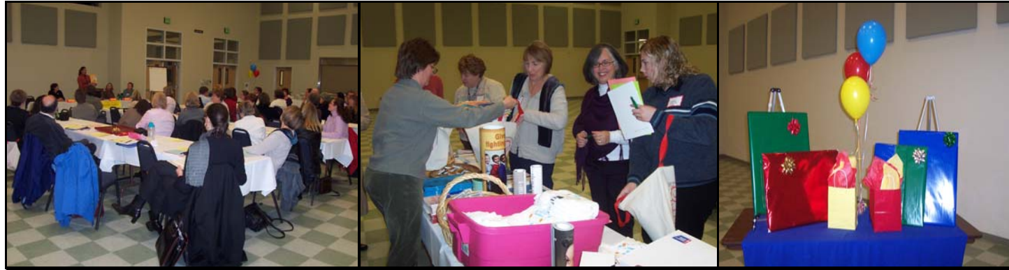
The January 2005 Grant Council Luncheon included presentations by local and regional experts on tobacco education, as well as raffle prizes, networking opportunities and a table full of free products including: smoking cessation materials, resource materials, baby products, and more.

Anyone who uses the phrase 'easy as taking candy from a baby' has never tried taking candy from a baby. -Unknown