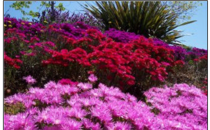
Landscaping near the County Administration Center.

With a trained and dedicated staff of skilled Craft Workers and maintenance personnel, together with the Division's support staff, Facilities Services handles more than 500 work and repair orders each month, including routine and preventive maintenance, repairs, remodeling and building modifications, grounds keeping, landscaping, and janitorial services.