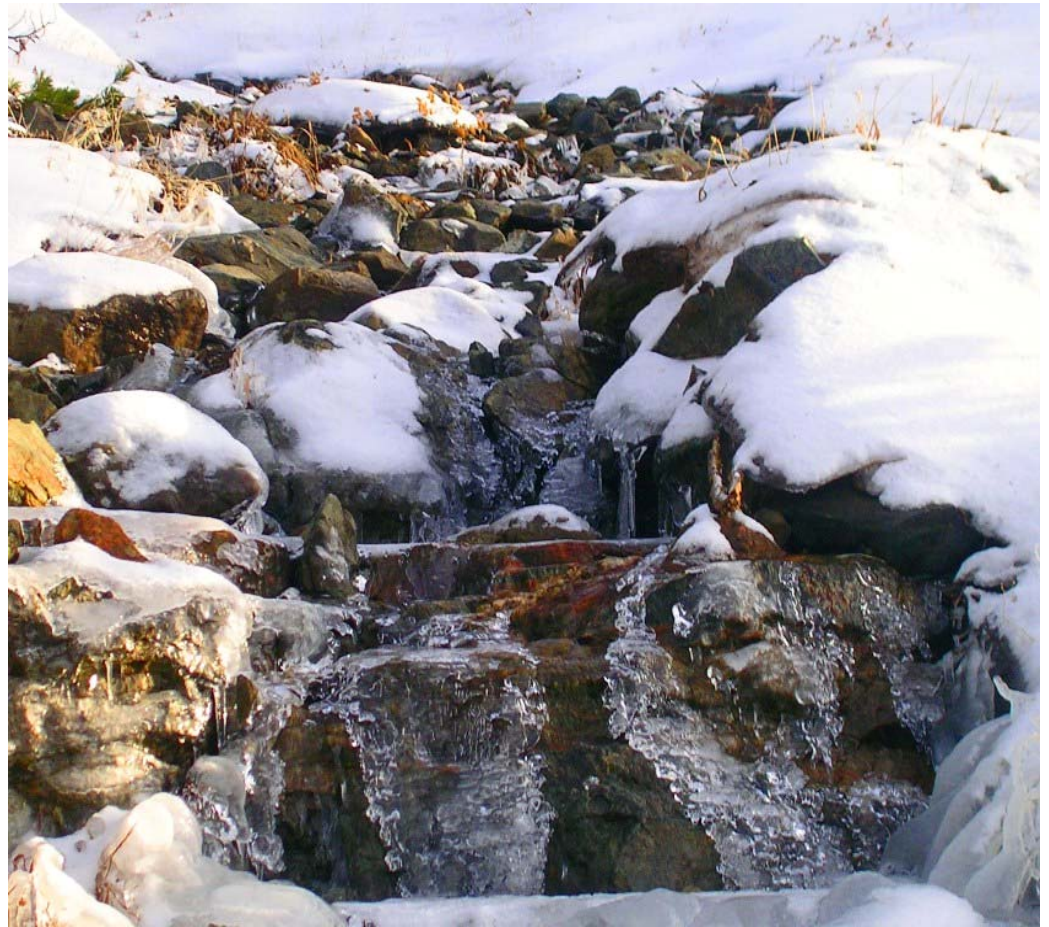
Creek Freeze

Butte County is currently accepting applications for the position of Director of General Services . For additional information on this career opportunity including salary, filing date and requirements for the position, please turn to page 4 and view our website at www.buttecounty.net/personnel .