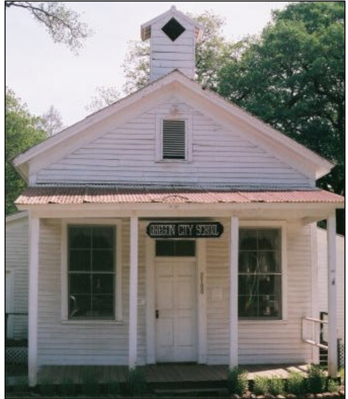
OREGON CITY SCHOOL HOUSE, BUILT IN 1885 Used with permission.