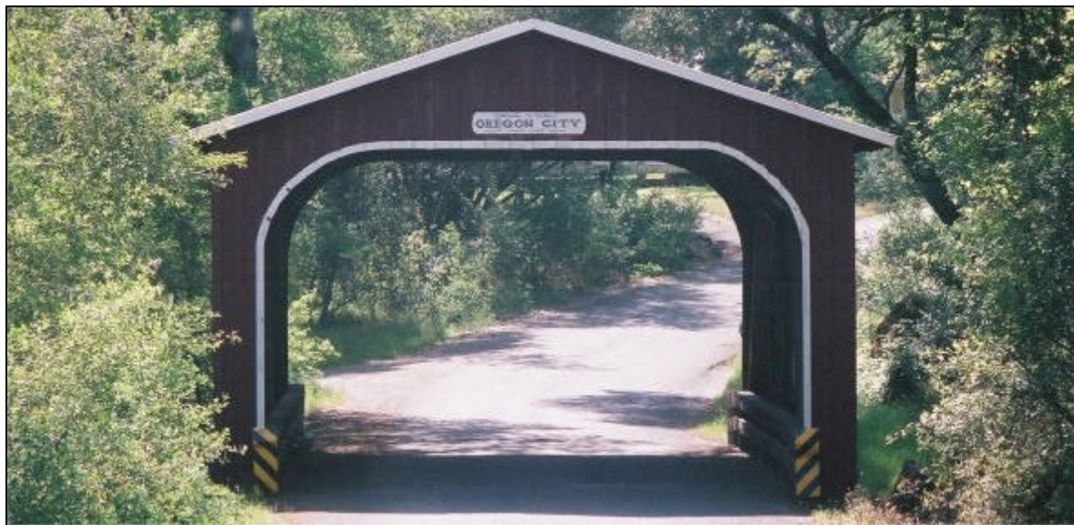
OREGON CITY COVERED BRIDGE Used with permission.