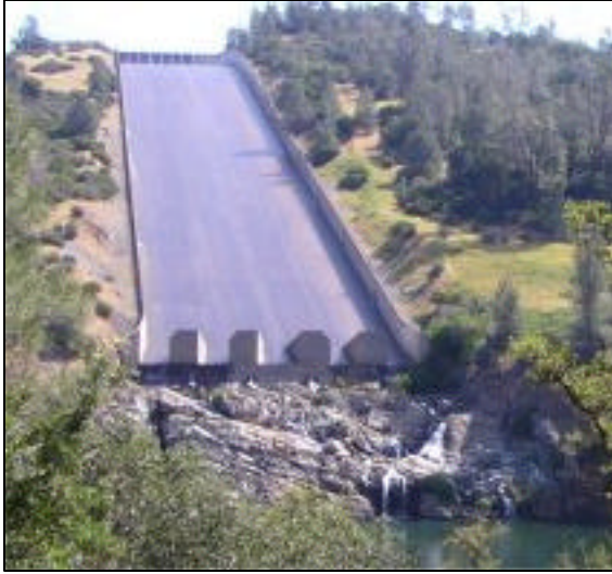
SPILLWAY, LAKE OROVILLE