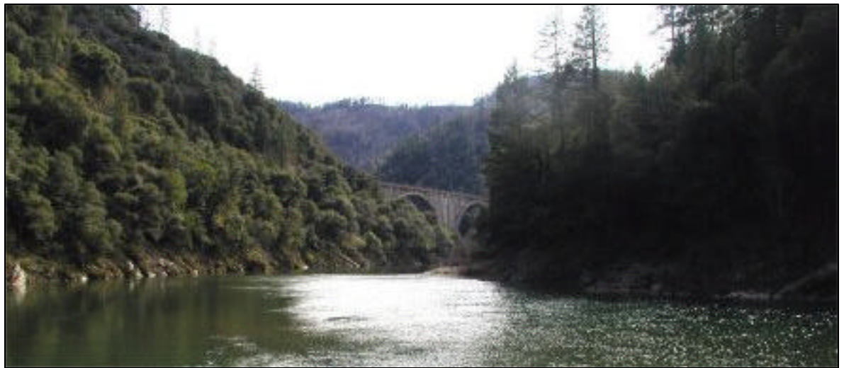
FEATHER RIVER CANYON

See page 6 for the exciting details about the Benefits of Becoming a Butte County Employee .