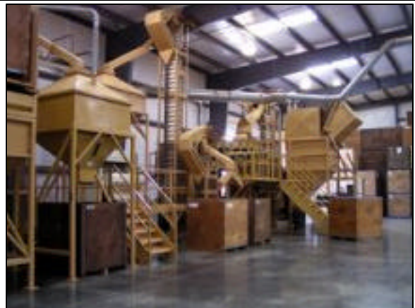
ALMOND PROCESSING PLANT