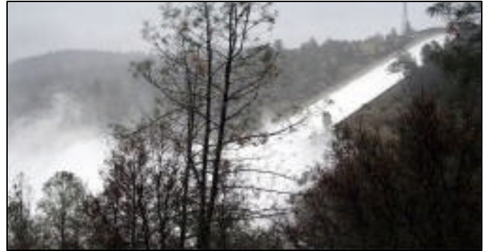
SPILLWAY, LAKE OROVILLE